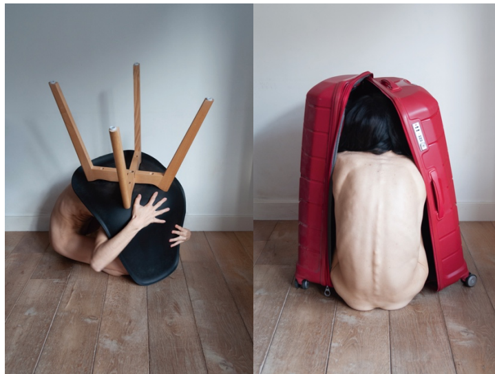
Josefina Sumar Efimeral Bodies (Series 2 & 8) 2025 Photography Dimensions variable