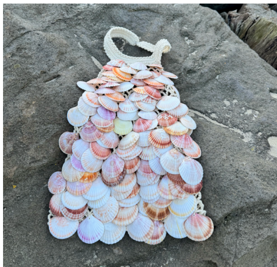
Wenqing Liang Shell 1 2025 shell and organic yarn 30 × 75 cm