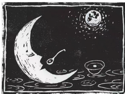
Yuchen Li Mooncycles 2024 lino print 15 × 20cm