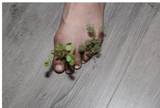
Ying Qian Plant Blindness 2023 Photography Dimensions variable