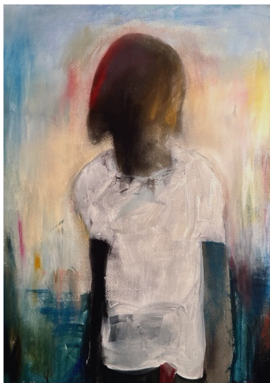
Taichun Zheng Self-portrait 2025 Mixed media on paper 55 × 40 cm