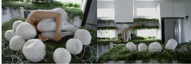
Beiyi Wang Cocoonloo 2022 Sound programming, performance, graphics Duration variable