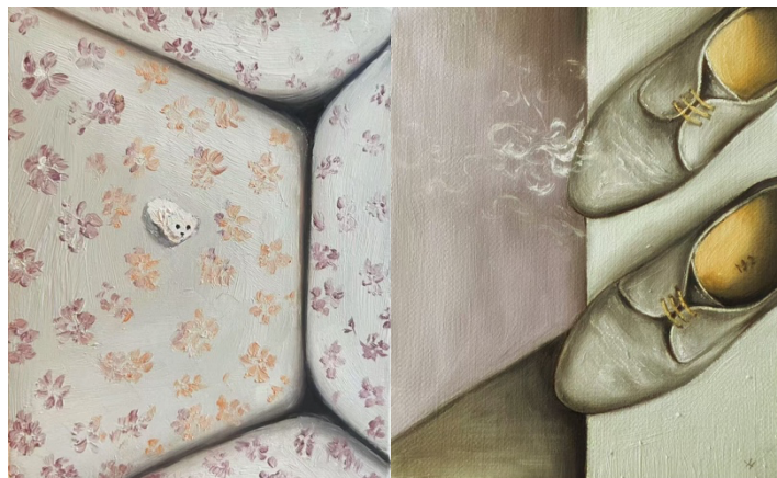
Holly Cheng Prophesy (No145)

Laser-cut engraving, acid dye, and hand sewing on wool fabric Dimensions variable (59 × 38.5 cm; 59 × 29.3 cm)