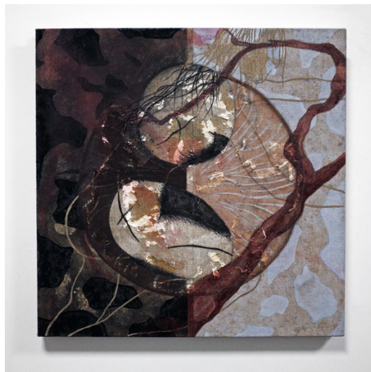
Tia Yoon Time Drop 2023 Rabbit skin glue, bone ashes, blood, salt, plaster, pencil, acrylic and oil on canvas 60 × 60 cm