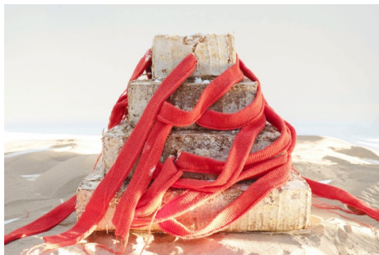
Zixiang Zhang After the Remains 2025 Fabric, straw, and mycelium 42 × 35 × 37 cm; 42 × 28 × 28 cm; 28 × 28 × 17 cm

For enquiries please email artsarchivelondon@gmail.com