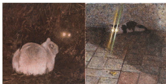
Xufei Qiao Cat in the Night No.0 & No.5 2025 Tempera on wood 15 × 15 cm (each)