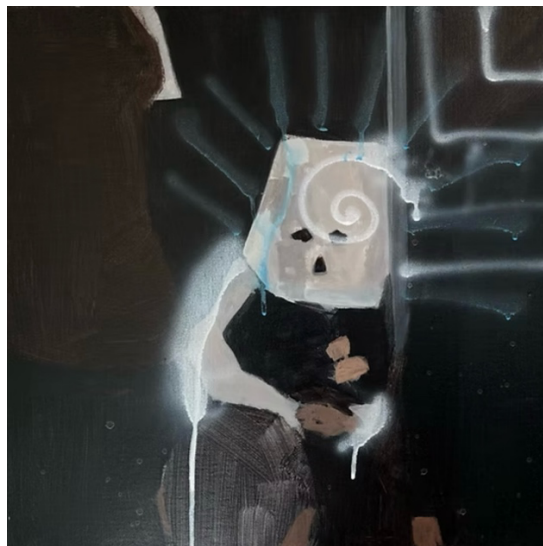
Doudou Wang The kid 2020 Acrylic on canvas 50 × 50 cm