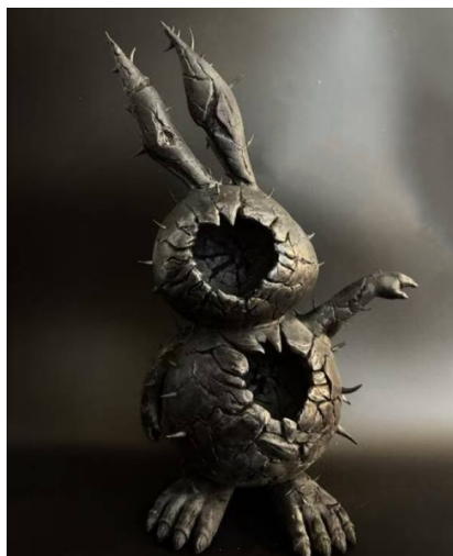
Rui Tao Hole 2025 3D Print 30 × 30 × 30cm