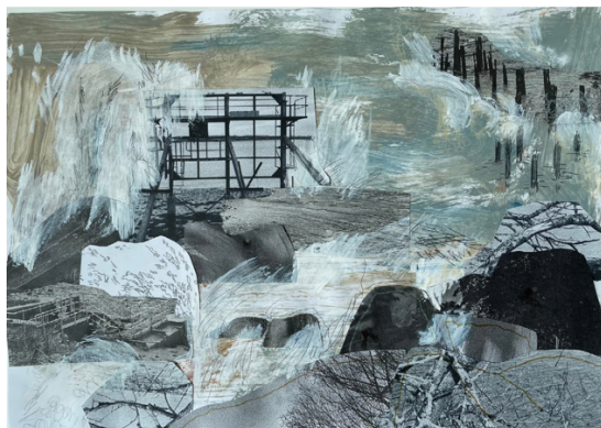
Tianyu Ren The Quiet of Unseen Light 2023 Mixed media collage, pencil, acrylic on paper 42 × 32 × 1 cm (framed)