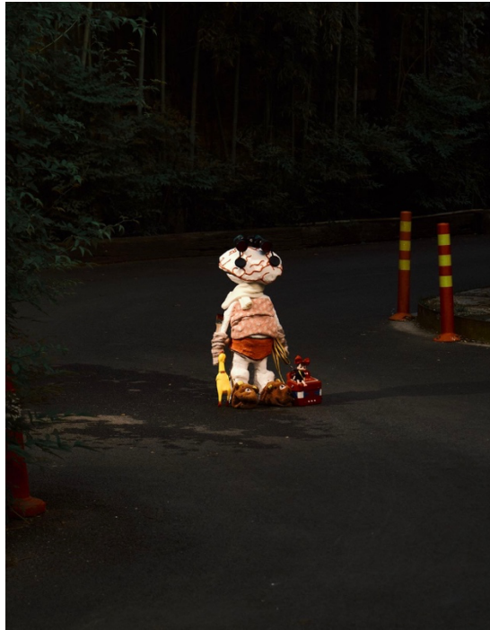
Maggie Meijun Kaleidoscope of Me 2023 Photography (Installation documentation) Dimensions variable